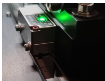
High resolution linear scale