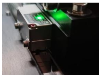
High resolution linear scale

For more information on any of our products or services please contact us: By e-mail: info@ucamco.com On the Web: www.ucamco.com