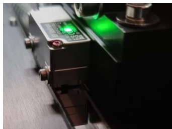
High resolution linear scale