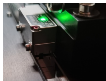
High resolution linear scale

By e-mail: info@ucamco.com On the Web: www.ucamco.com