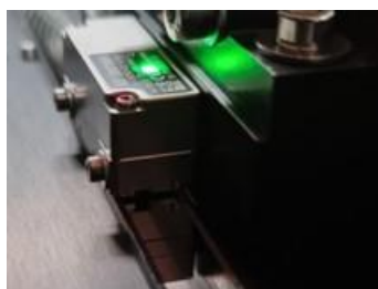
High resolution linear scale